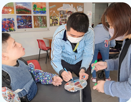
Volunteers and residents decorating Easter eggs together.