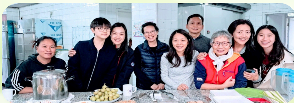
Thank you Sunday Cooks for making so much delicious food for us.