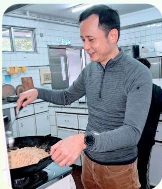
Delicious food to share.