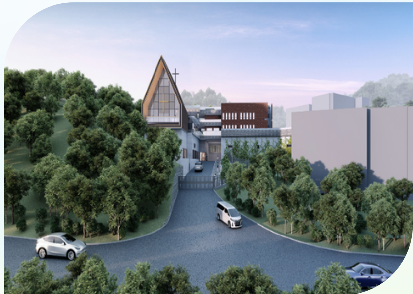
The exterior of the HOLF new building at Tai Po site

On 2 January 2025, the Government handed over the land of the Tai Po site to us. We now embark upon a new era for HOLF. Our contractor has started construction of the new premises. As the government is developing Kwu Tung North, we need to be able to move to the new Tao Po site by the end of 2026.