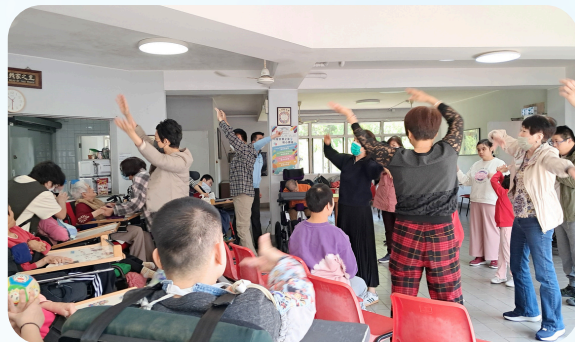
Volunteers singing for our residents.