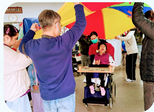
Residents enjoying the parachute game.