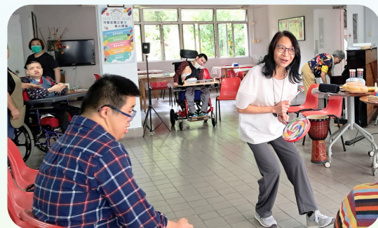
Volunteers singing for our residents.