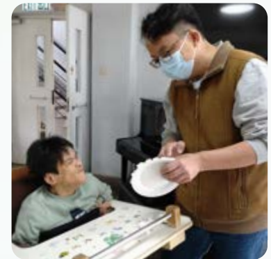
Tip Tip having 1-1 activity time with a volunteer.