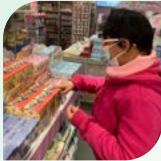
Hephzibah selecting snacks.