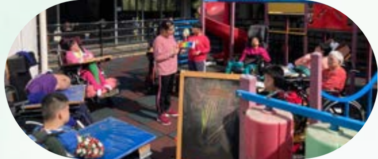
Residents enjoying the sunshine in the playground whilst doing activities.