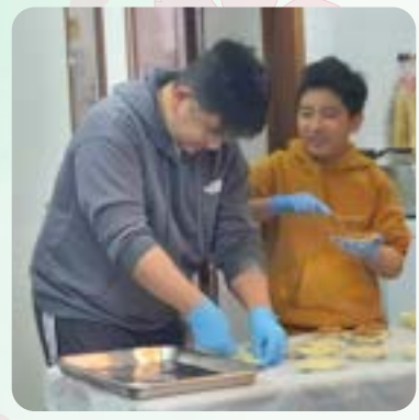
Father and son volunteering together. They made beef pies! Yum!