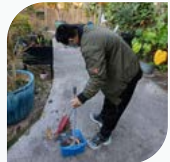
Ka Lok sweeping the leaves in the sensory garden.