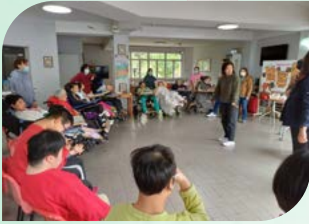
Our residents enjoying group activities with volunteers.