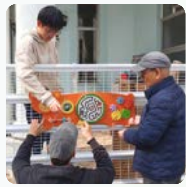
They also installed a sensory board for our residents!